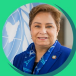
Patricia Espinosa United Nations Climate Change Executive Secretary